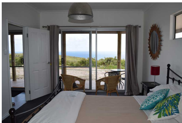
Bremer Bay B&B

Sipping evening drinks on the balcony and waking up to the same lovely view were very pleasant experiences.