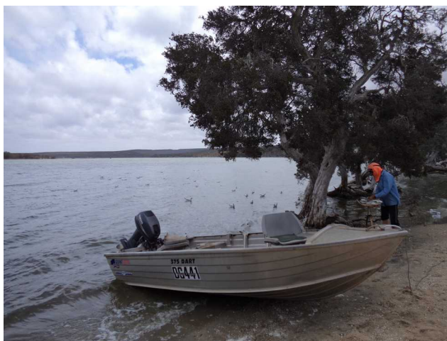
Miller's Point Reserve

http://www.wanowandthen.com/Bremer-Bay.html