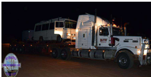
Shipping the Coaster to Perth

We got to Pardoo Roadhouse, just 13km from our first intended destination when it all went wrong.